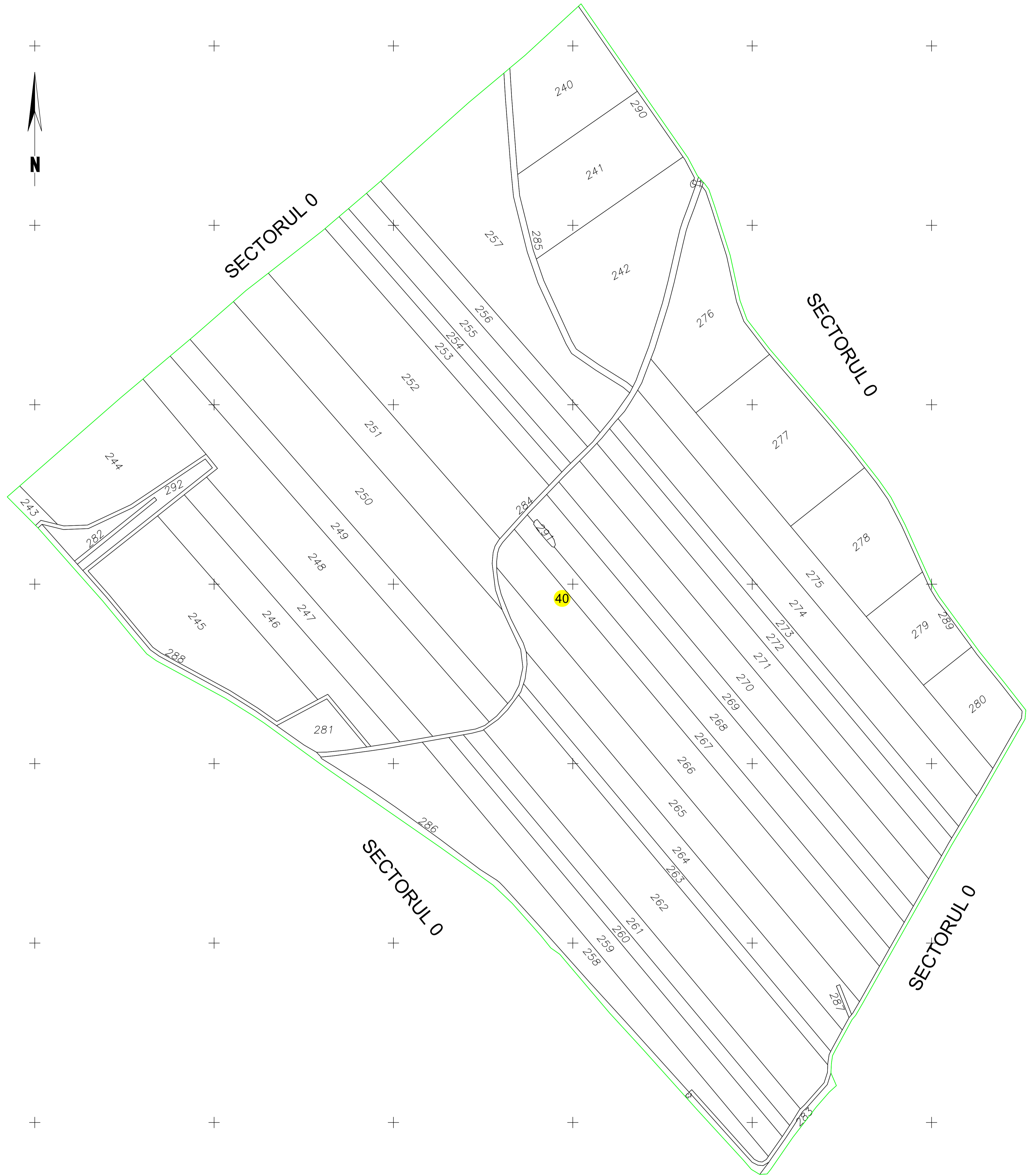
—SCHITA CU DISPUNEREA SECTOARELOR CADASTRALE U.A.T PECIU NOU, JUDETUL TIMIS